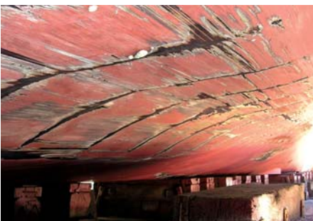
Bottom damages as a consequence of machinery failures1