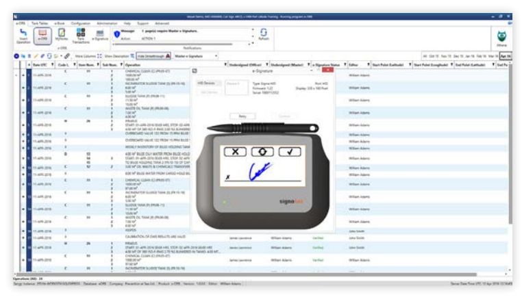
ε-ORB Signature Pad Functionality