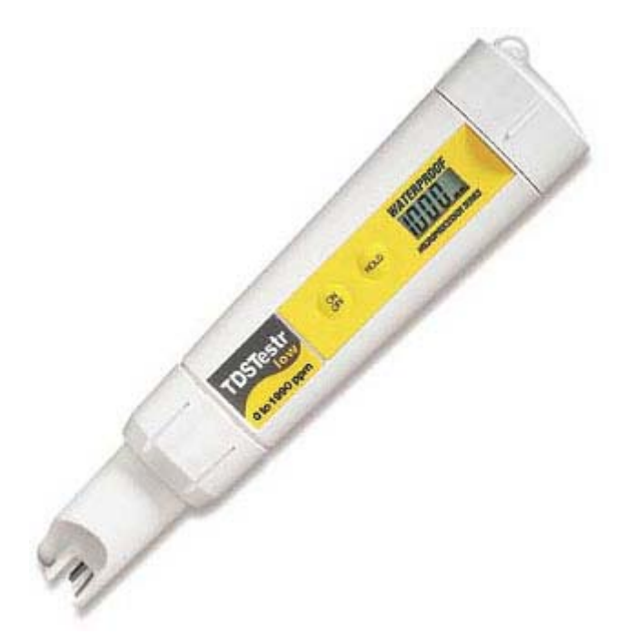
Figure 4. The Oakton TDS Tester.

Unfortunately, there is no single exact conversion between conductivity and ppm NaCl as the conductivity of a sodium chloride solution is not linear with concentration (that is, 20 ppm NaCl is slightly less conductive than twice that of 10 ppm NaCl, the reasons for which are beyond this article, but in a sense, the more ions there are in solution, the more they interfere with each other in terms of sensing the voltage, and in terms of moving in response to it). Nevertheless, for values in the range sensed by most TDS meters, a rough conversion is that 1 ppm NaCl = 2.1 \,\mu S/cm.