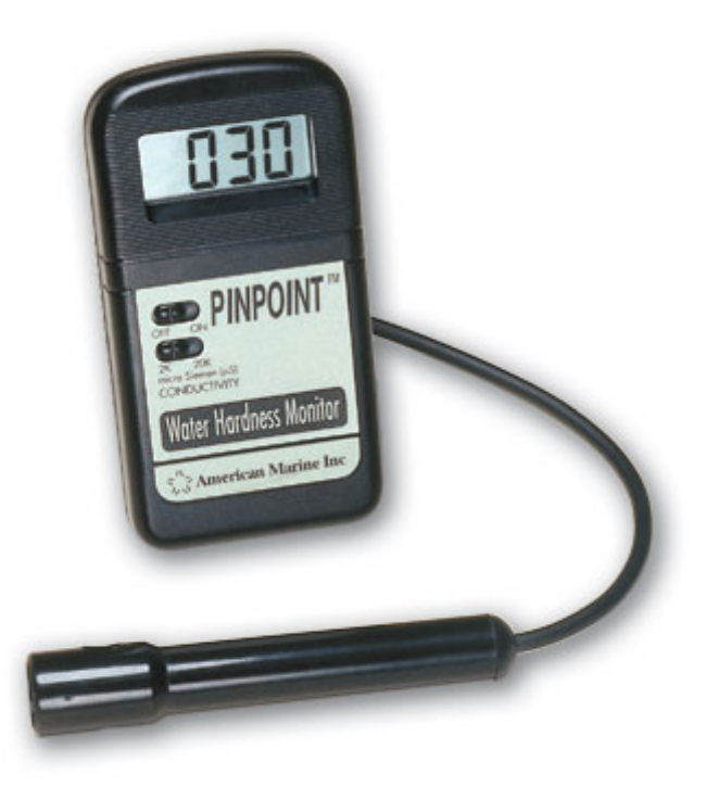
Figure 2. The Pinpoint conductivity meter.

If you choose a meter that reads in mS/cm, then all of the concern about ppm units that is described below can be eliminated. The Pinpoint Conductivity meter is such a unit (Figure 2). Some devices allow either unit to be displayed, although these are usually more expensive, such as the Oakton Con 200 (Figure 3).